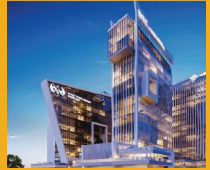
Q Town Business Solutions, Inova Building, 76140 Santiago de Querétaro, Qro. Mexico.