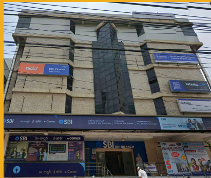
Santhi Plaza, 4th Floor, Gayatri Nagar, Revenue Ward 8, Vijayawada, 520008