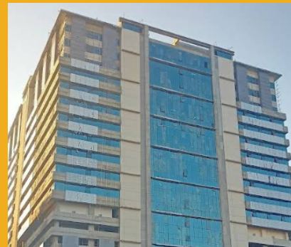
5th Floor, SVS One Building, Patrika Nagar, HITEC City, Hyderabad, Telangana 500081