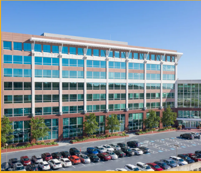
3333 Warrenville Road, Suite #200 Lisle, Illinois 60532 USA.