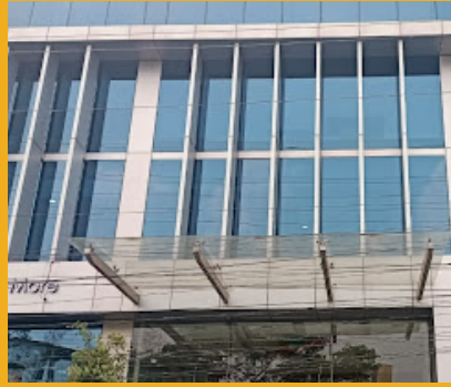
1st floor, Legend Platinum, Jubilee Enclave, Hitech City, Hyd, Telangana 500081